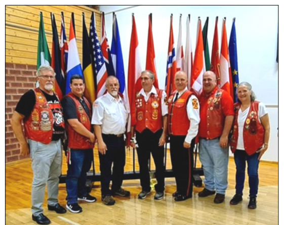
Massachusetts Red Knights representing MA-1, MA-2 and MA-4 at the International convention in Austria.

A letter from the International President was shared about the nomination process for the position and the pending special election. According to the By-Laws Section 3:05, we will hold an election to fill the remaining term for VP. Please follow the guidelines if you would like to nominate anyone for this position.