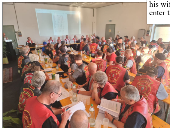
Members at the Annual Business Meeting