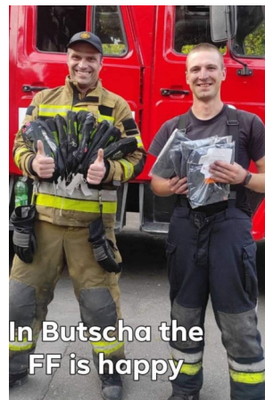
In Butscha the FF is happy