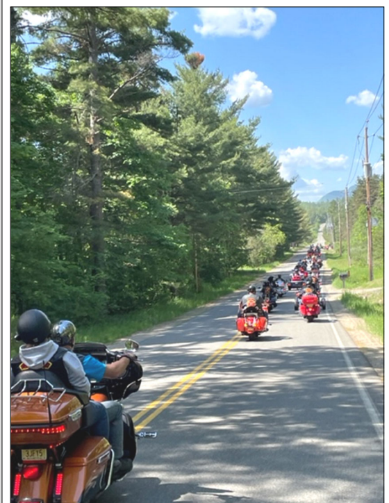
180 Bikes participated in the escorted ride into the Lake Placid area and a cookout at an area FD during the Yankee Rally.