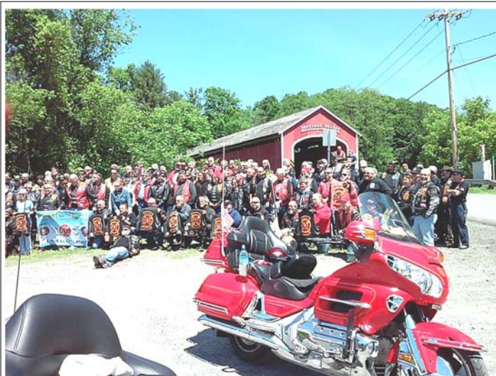
New York hosted Covered Bridge “Spanner Ride” during Americade