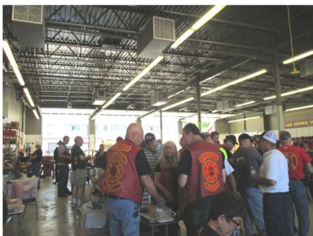
Selling wares and socializing at the RKMC Open House at the LGFD