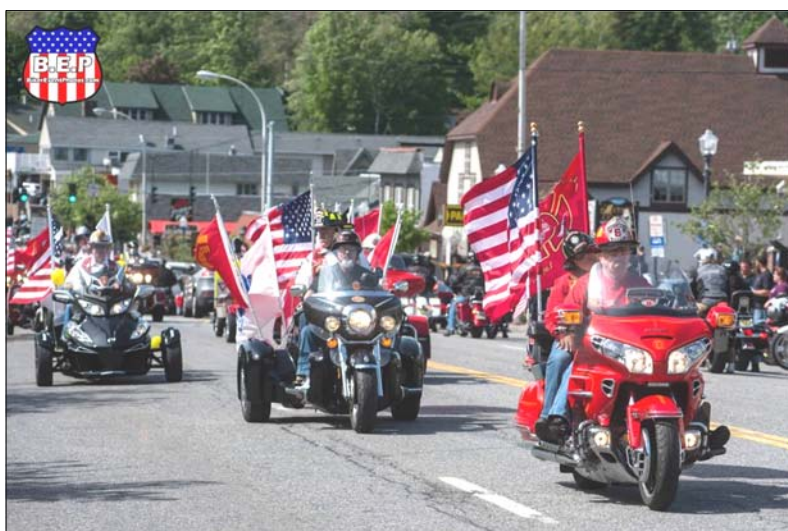
A great day for a parade!