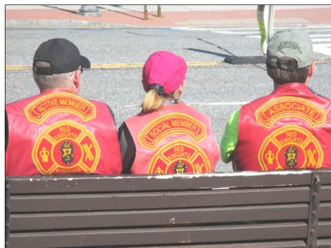
Watching the world go by on Canada Street — an Active, Social, and Associate member!