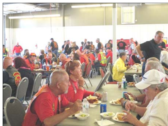
Breaking bread at the LGFD with a few members of our family