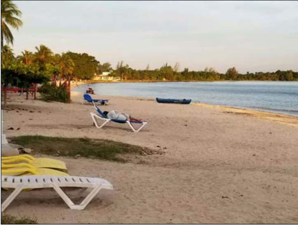
From a beachfront in Cuba...