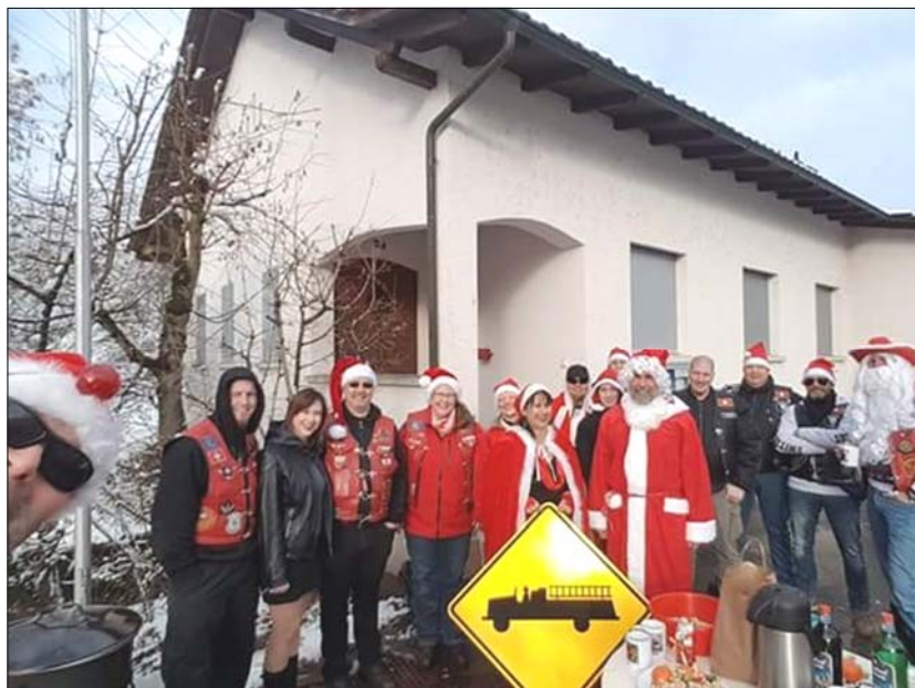
Santa unveiled a little piece of Massachusetts at the RK Swiss-1 Club House during that chapter's Christmas party!

We collected over $500 in cards to share! What a wonderful testament of the generosity of our members.