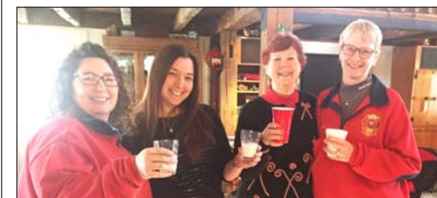
Sampling at the December Breakfast Club!