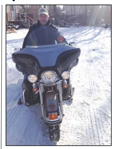
Even if it was just sitting on it and listening to the engine, it felt good! But it is no longer 3 degrees Fahrenheit and we can think about what a great riding season 2015 will be — Come join us!

We may not always be in a position to give out as many donations as we have in the past. I'd like to just set the pace that this be the year we look to limiting the number of contributions to a set number per year and have some in reserve in case a member needs a lending hand or a tragic event hits another local firefighter's family. I'm not looking to build our kitty or anything like that, I'd like to just come up with a set number of donations if that's possible. Let me know what you think.