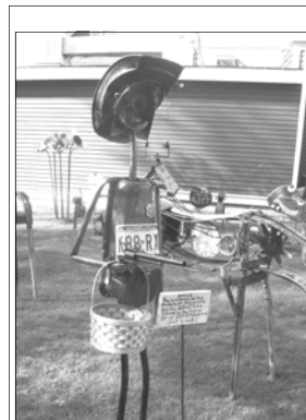
We found a yard full of "Junk Art" when we stopped for ice cream!

Sunday was another perfect weather day when we loaded up and headed back home. Unlike last year's temperatures in the 20's with spitting snow, this year we enjoyed sunshine and temperatures in the 60's. A stop at Page's Bookstore and Coffee Shop in Conway was the finishing touch of a fun weekend.