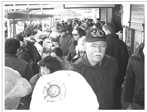
Heading through the crowd at Hay Market Square