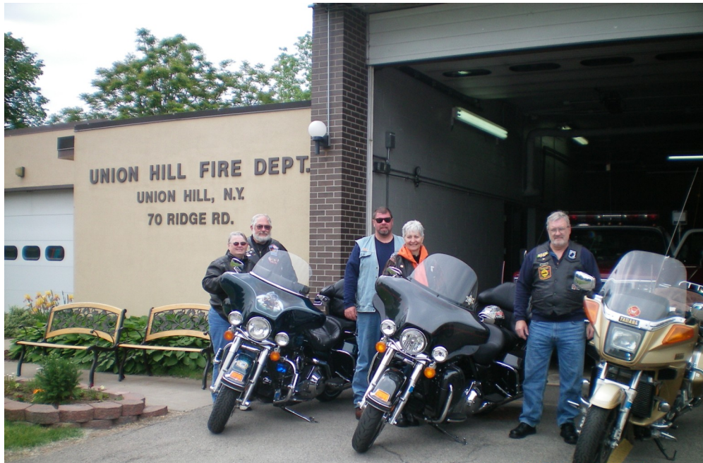
Members of NY 22, who were the first to receive the new patch, on their Fire House Ride