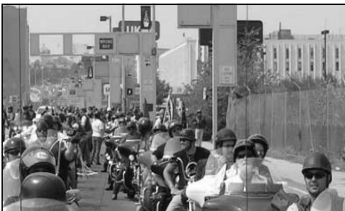
Members of NJ-14 at the 5th annual 9-11 Memorial Ride