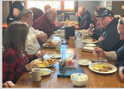
Photo albums (physical and electronic) are kept displaying pictures of everyone who has completed the Grand Tour.

POLAR BEAR RIDE! Our Polar Bear Ride on November 7 had 11 riders and another 8 members and friends meeting us at the King Phillip in Phillipston for their Sunday Brunch.