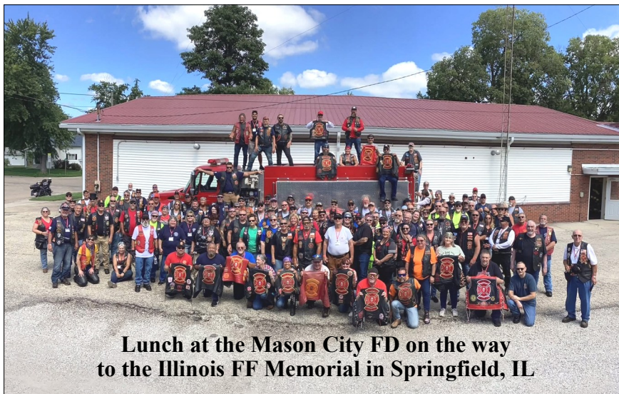
Lunch at the Mason City FD on the way to the Illinois FF Memorial in Springfield, IL

Fees are fully refundable up to 8 months prior to the voyage.