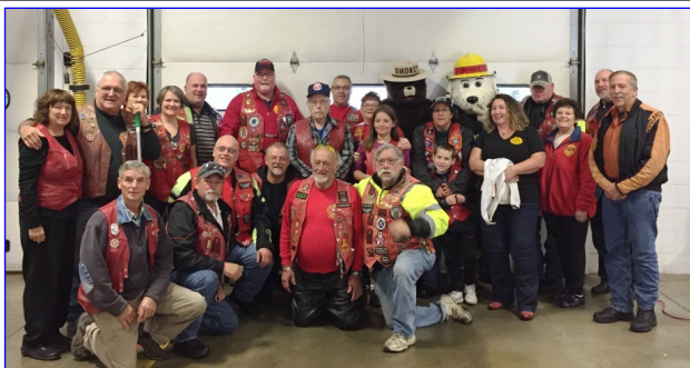
A great turn out (and a great breakfast) at the Jaffrey FD Fire Prevention Week breakfast.

How about a gift membership to the American Motorcycle Association (AMA) for that special rider on your list? The AMA and its Massachusetts counterpart MMA work tirelessly to support our rights and promoting motorcycling around Massachusetts and around the county. Our memberships help support their endeavors.