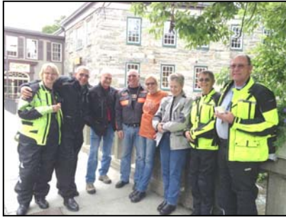
Ice Cream in the White Mountains

The weather was great as was the friends to share it with. Chalk up another great time with the Red Knights!