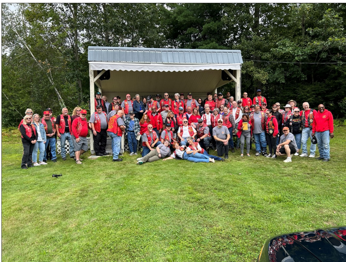
Members from Massachusetts, throughout Region-1 and beyond attended the MA-2 40 th anniversary celebration.